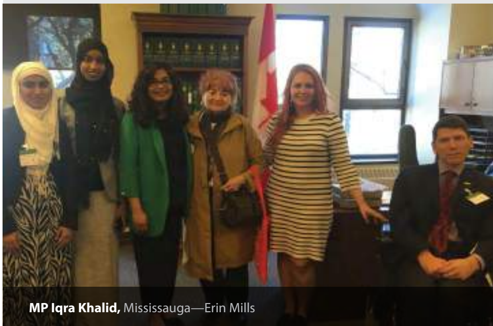
MP Iqra Khalid , Mississauga—Erin Mills