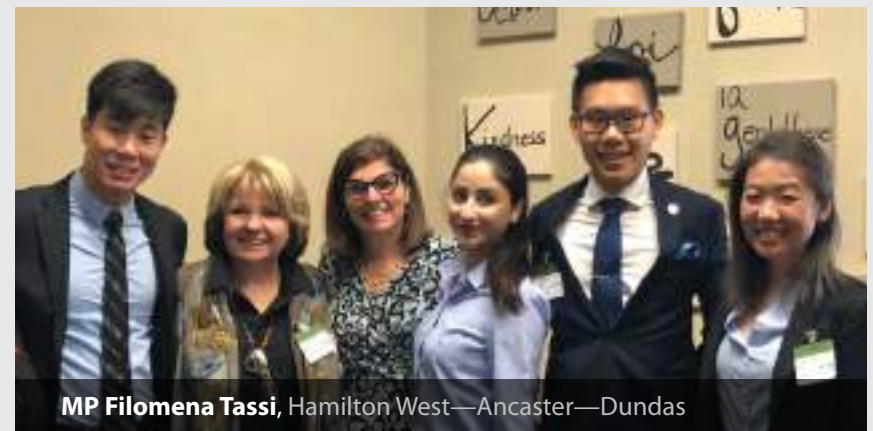
MP Filomena Tassi, Hamilton West—Ancaster—Dundas