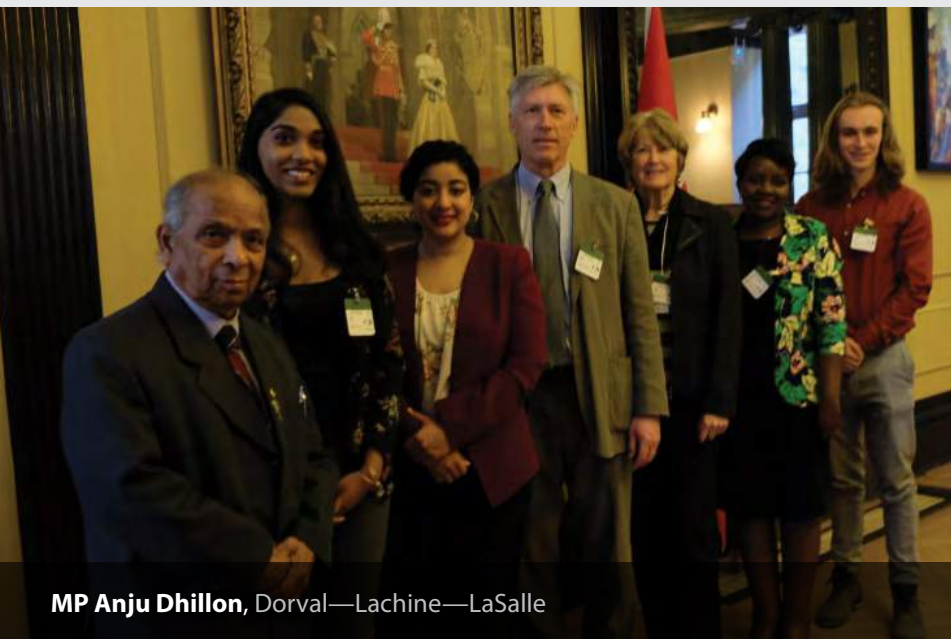
MP Anju Dhillon , Dorval—Lachine—LaSalle