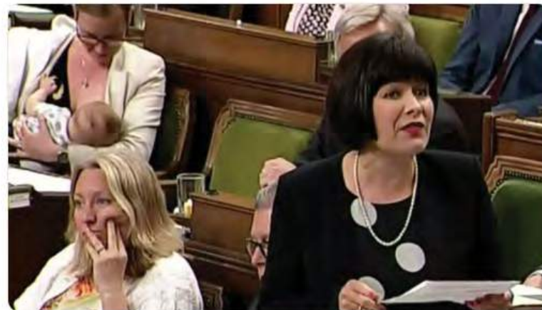
SafelyFed Canada, Bill Morneau, Maryam Monsef and 7 others

Some places in the 🌍 nearly 50% of women can't or don't feel comfortable breastfeeding in public or at work. This has to change!