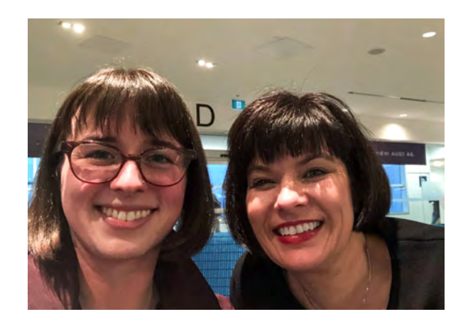
Hon. Ginette Petitpas Taylor - Former Minister of Health

Thanks for the opportunity to chat and we look forward to more discussions!